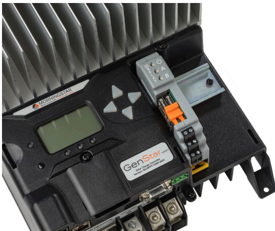
ReadyRelay installed in a GenStar MPPT charger